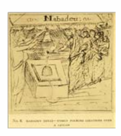
Fig. 1.Sketch by Peter Mundy. 1632.

British merchant and travellerPeter Mundy visited Varanasi in 1632. He described the populous city's Hindu temples and noted that the roads, though paved, were narrow and twisted. He calledthe main deity as 'Cassibessuua' (Vishweshwar of Kashi- Varanasi) and sketched(see fig. 1) of the inner sanctum of the temple.