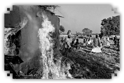
Bengali Hindus being driven out of their homes