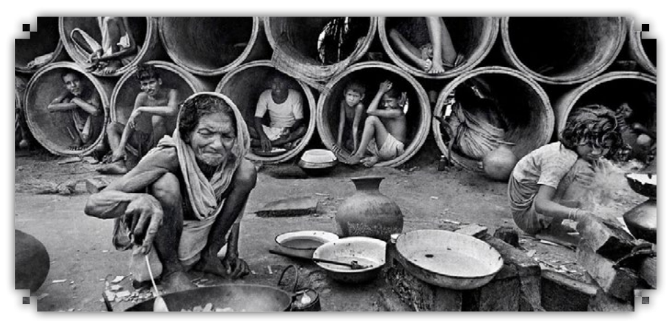
A Bengali Hindu refugee woman cooking food for her family