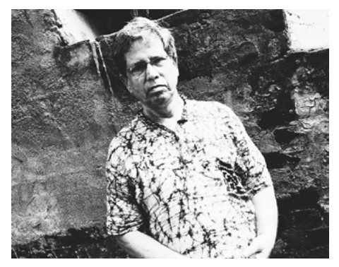
sky like venom spreading into arteries." Mondal doesn't want those days back gain. Or hear those cries.

headmaster in my village school fell to a traitor's sword, hell broke loose. The headmaster had gone to stop a riot in the next village and tell the Hindus and Muslims, many of whom had been his students, not to kill each other for the sake of religion. The killings stopped but when the old man was on his way back, a Muslim man hacked him into two. As the headmaster and two of his young students fell, 'Allah ho Akbaar' cries filled the night