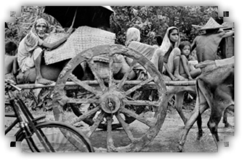
Bengali Hindu refugees fleeing from East Pakistan on Bullock Carts