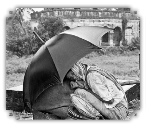
A Bengali Hindu refugee woman taking shelter under an umbrella with all her belongings