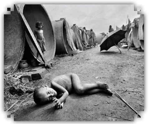
Bengali Hindu refugee infant suffering from malnutrition