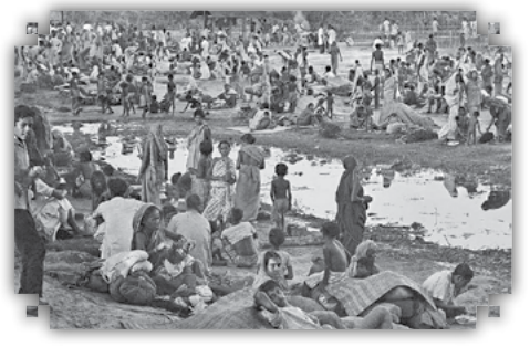
Bengali Hindu refugees sheltered in India in 1971, having fled from East Pakistan to escape Persecution