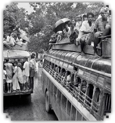
Overloaded buses of Bengali Hindu Refugees