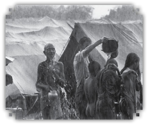
Bengali Hindu refugees relieving themselves during Monsoon rains in Haringata Refugee Camp