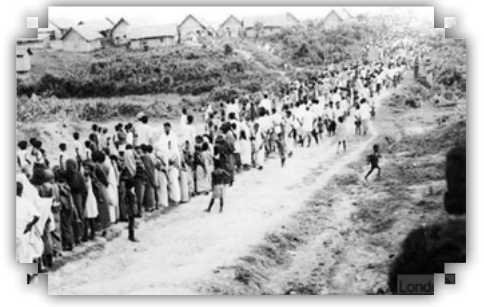
Bengali Hindus fleeing East Pakistan for India's refugee camps (1971)