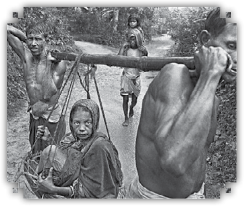
Bengali Hindu refugees toward India from Bangladesh to escape by Pakistan army's genocide