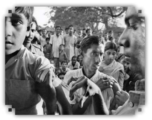
Bengali Hindu refugees being vaccinated in the refugee camps