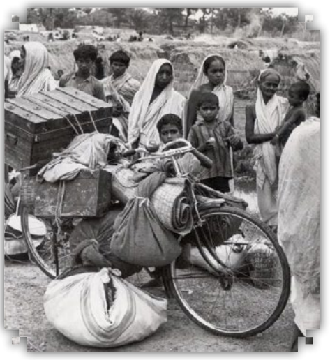
Refugees from in East Pakistan (later Bangladesh) in India, 1971

Bengali Hindu Refugee Photos Credit: Flickr.com