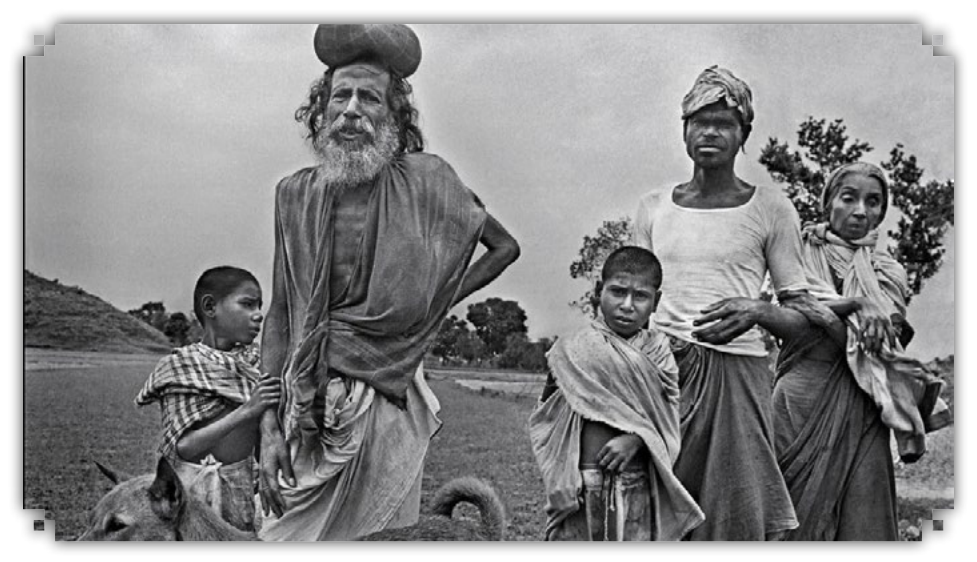
A family of Bengali hindu refugees fleeing to India with a handful of their belongings