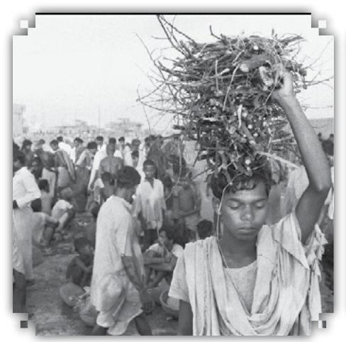
Haringata Refugee Camp, 1971