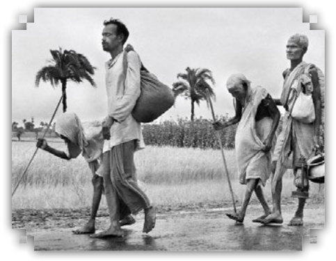
Bengali Hindu refugees walking towards India to seek save themselves from being persecuted in Bangladesh