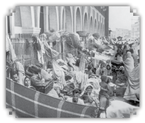
Bengali Hindu refugees camped alongside Howrah's train station in Calcutta