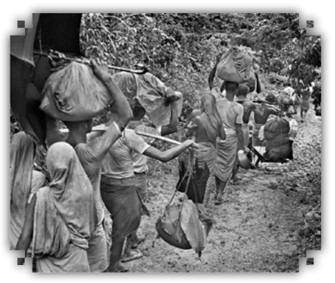
Bengali Hindu refugees fleeing from Bangladesh to India with their belongings